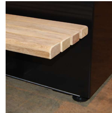
Optional Bexley planter benches in natural finish FSC iroko hardwood