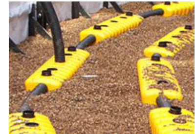
Optional Mona watering system