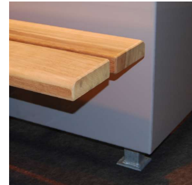
Optional Henley planter benches in natural finish FSC iroko hardwood

Integral planter benches, with or without armrests, can be supplied with Vertex planters. As standard 2 bench designs are available. Other designs can be included upon request. The Bexley bench consists of 4 no. 70x45mm timber slats and the Henley bench has 2 no. 145x45mm wide bench slats. The timber slatted benches bolt onto galvanised mild steel brackets, attached to the planter sides. Benches can be fitted to 1, 2, 3 or 4 sides to suit your requirements. The choice of material and finish is the same as for the planter. As standard the brackets will have a galvanised finish. As an optional extra, they can be polyester powder coated.