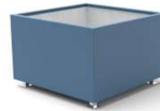
RAL 5010 Blue