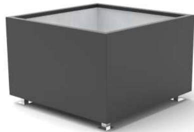
RAL 9005 black

As standard, the Stratum aluminium planter body will be supplied with a RAL 9005, black satin polyester powder coated finish.