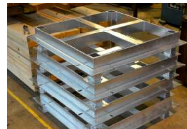
The Stratum planter base frames are supplied with a hot dip galvanised finish

The mild steel base frames will be supplied with a hot dip galvanised finish.