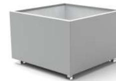
RAL 7036 Mid Grey