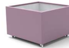
RAL 4001 Red lilac