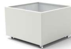
RAL 9002 Light Grey

As an extra cost option, the Stratum aluminium planter body can be supplied with the following polyester powder coated RAL colours.