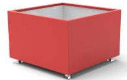
RAL 3020 Red