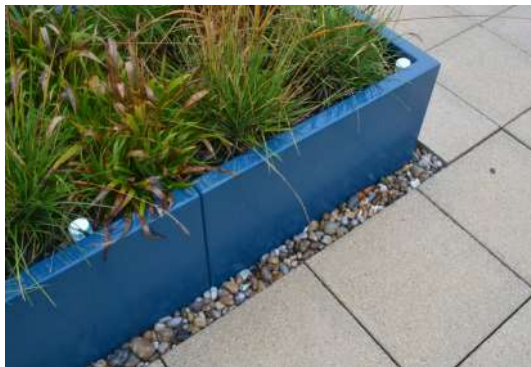
Optional RAL 5010 Blue, satin