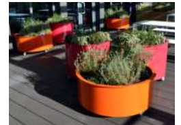
other colours available on request