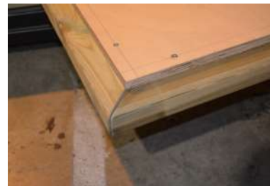
95x45mm FSC®-certified treated redwood frame with 18mm FSC®-certified hardwood faced plywood

The standard timber base is suitable for installations on level ground.