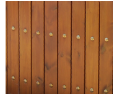
FSC treated redwood with an optional teak stained finish

The products should be cleaned down, very lightly sanded and re-coated with the original stain.