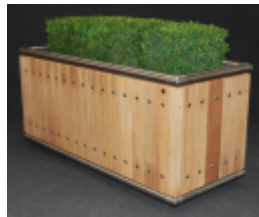
FSC iroko hardwood with a natural finish

As standard, all FSC iroko hardwood planters will be supplied with a natural finish. Due to the nature of the material and the density of the grain, iroko hardwood is not capable of taking a preservative treatment. Iroko hardwood is a naturally durable material, giving a life expectancy in excess of a treated softwood.