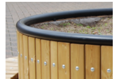
60.3mm diameter top rail, polyester powder coated RAL 9006 with a satin gloss level

Depending on stock levels the powders are available in 3 gloss levels; gloss, satin and matt.