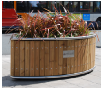
FSC treated redwood with a natural finish

As standard, all FSC treated redwood planters will be supplied with a natural finish. The preservative treatment process will colour the timber a light brown/green.