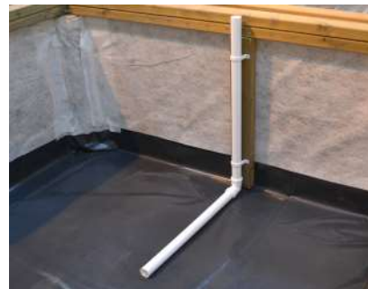
Polythene liner with filler pipe