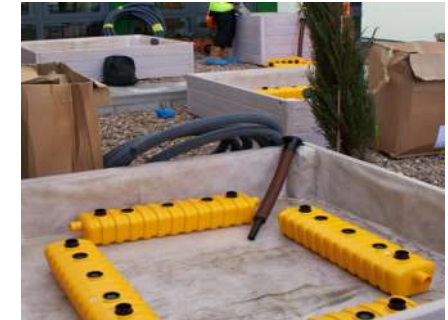
Water storage tanks and filler pipe

For full details visit: www.green-tech.co.uk