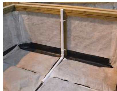
Hydroleca sacks laid out in base of planter