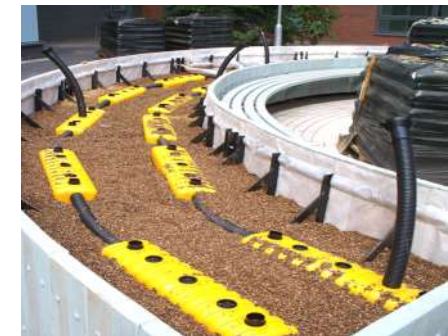
Planter ready for soil and planting