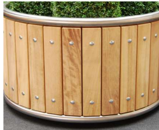
Section thro' planter

The Stockport, timber and metal planter, is constructed by bolting 95x45mm section vertical walling slats to an internal steel frame. The square and rectangular planters will have 45x45mm corner fillets fitted into the external corners. The internal base is constructed using 75x50x3mm mild steel RHS and 75x50x6mm mild steel angle. The 50x10mm mild steel flat uprights and cross brace straps support the horizontal 25x5mm mild steel flats. FSC®-certified hardwood faced plywood is laid onto the base. 50mm high mild steel planter feet are fitted to the underside of the base frame, to ensure that the load is safely transferred to the ground. The planter has a 60.3mm Ø mild or stainless steel CHS top and bottom feature. When fully constructed, the inside of the planter is fully lined with a geo-textile lining, that allows water to drain through whilst retaining the soil fines.