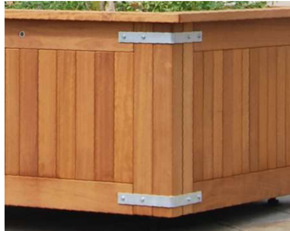
Section thro' planter

When fully constructed, the inside of the planter is fully lined with a geo-textile lining, that allows water to drain through whilst retaining the soil fines.