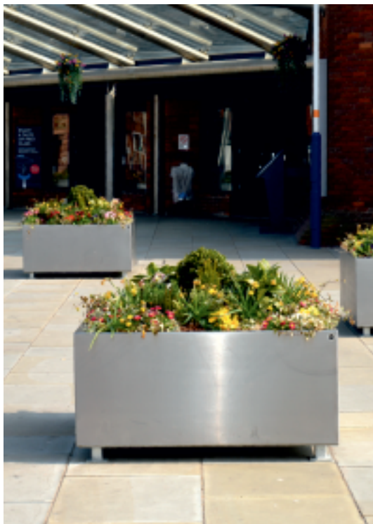
Gretton stainless steel planter, shown here with optional galvanised mild steel base with legs

The Gretton sheet metal planter, comprises of a fully welded stainless steel planter body on a FSC certified timber base.