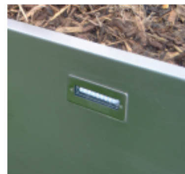
Optional aperture for LED light fitting