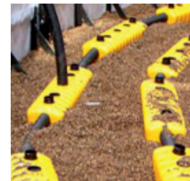
Optional Mona watering system