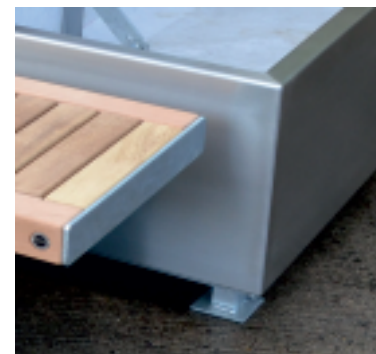
Optional Sheldon planter bench

Integral planter benches, with or without armrests, can be supplied with Gretton planters. As standard 2 bench designs are available. Other designs can be included upon request. The Bexley bench consists of 4 no. 70x45mm timber slats and the Henley bench has 2 no. 145x45mm wide bench slats. The timber slatted benches bolt onto galvanised mild steel brackets, attached to the planter sides. Benches can be fitted to 1, 2, 3 or 4 sides to suit your requirements. The choice of material and finish is the same as for the planter. As standard the brackets will have a galvanised finish. As an optional extra, they can be polyester powder coated.