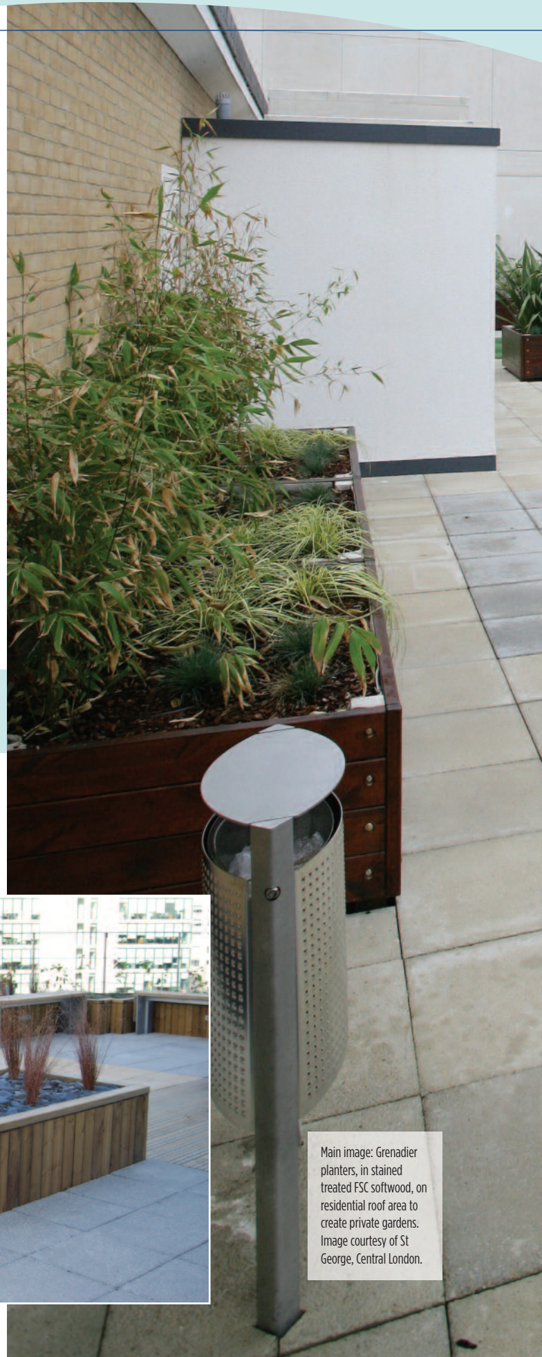
Main image: Grenadier planters, in stained treated FSC softwood, on residential roof area to create private gardens.