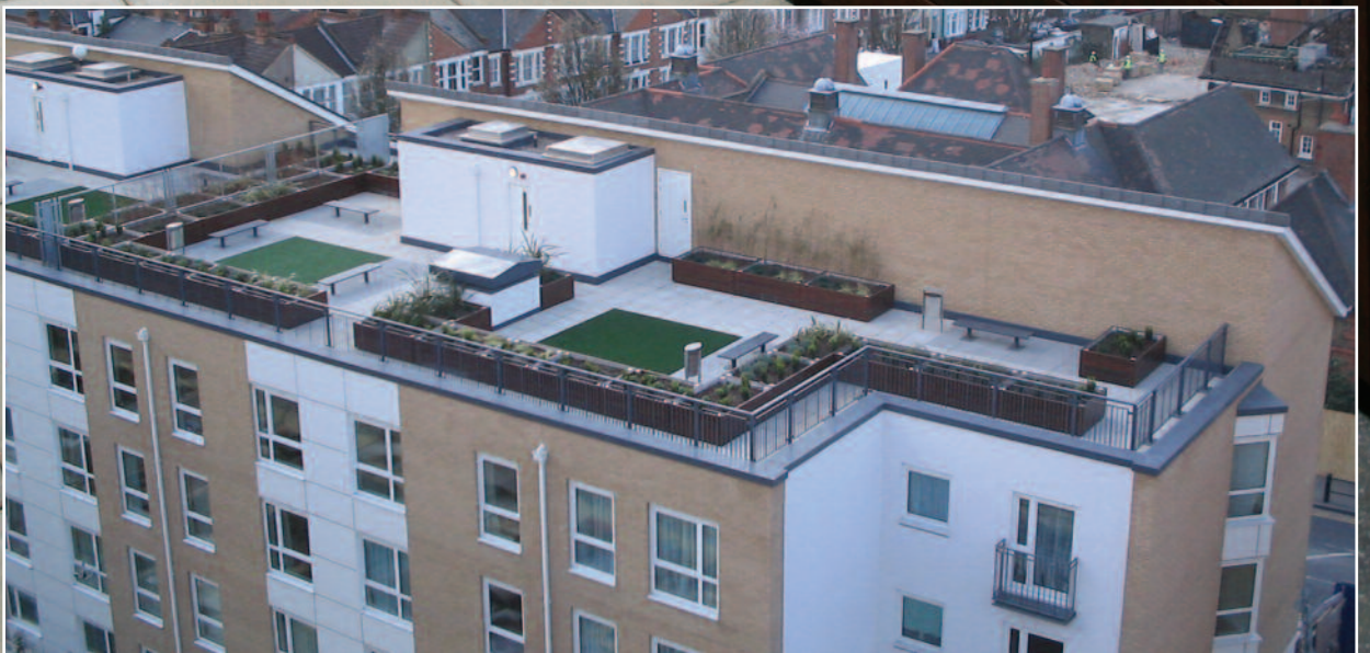
Grenadier planters, in stained treated FSC softwood, on residential roof area to create private gardens. Image courtesy of Broadway Malyan.