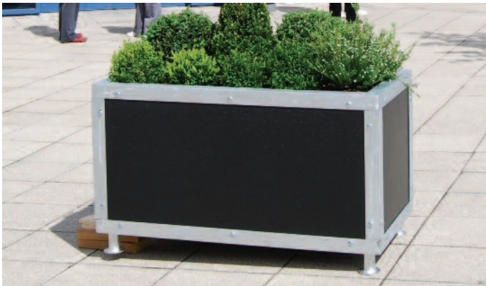
1250 x 635 x 715mm high