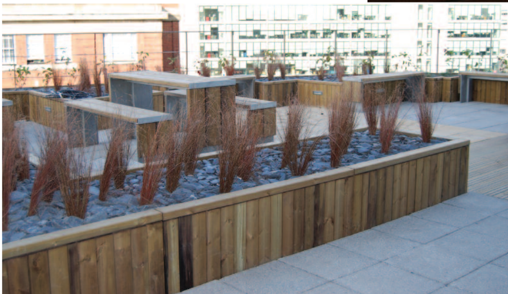
Diplomat planters, in natural treated FSC softwood with matching tables and benches, on an office roof scheme in central London.

The components can be taken up onto the roof for assembly on site. The Gallery planter has a galvanised mild steel frame with bolt-on infill panels manufactured from, self-coloured, high density polyethylene.